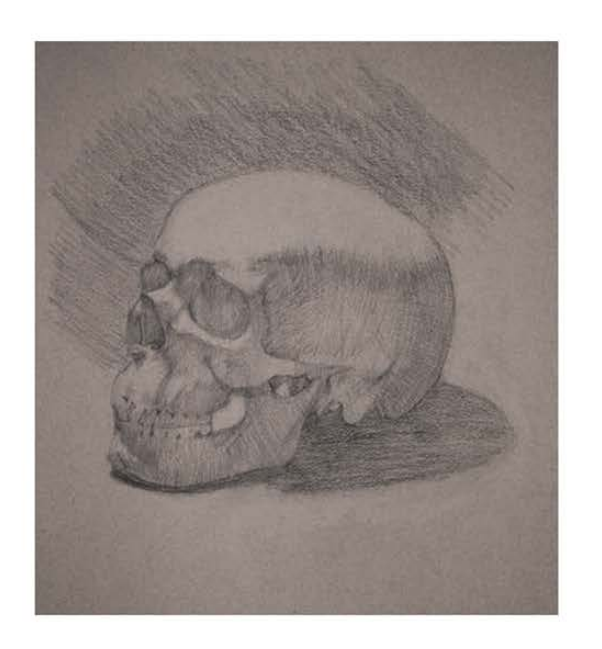
Once your general tone is down, begin to work up the value range within the shadow. Use the general tone that was blocked in earlier as your lightest area of the shadow (the reflecting lights). At this stage temporarily think of the tone of the paper as your light mass.