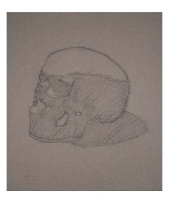
Once the proportions and major bulk shapes of light and shadow have been clarified, block in a general tone for the entire shadow mass. Make the block in value of the shadow mass only slightly darker than the paper.