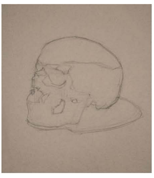
Carefully measure and correct the overall proportions and alignments. Focus on the specific shape of the shadow and light masses but do not block in the values. You are laying down a foundation for the separation of the specific light and shadow mass shapes.